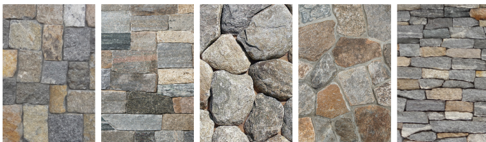
Sq & Rec Ashlar Rounds Mosaic Ledge stone

Enjoy the beauty and durability of real natural stone! Available in thin and full bed depth, our line of natural stone veneer is the perfect way to enhance any project.